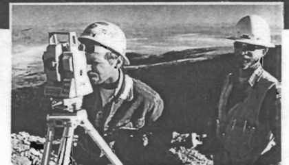
New mineral resources are vital to provide the basic needs of future generations.

The demands in the U.S. for minerals have grown in diversity and quantity. With less than 5 percent of the world's population and 7 percent of its total land mass, our nation consumes a quarter of the entire globe's mineral production. Demands will continue to grow. Even now it is necessary to produce 40,000 pounds of new minerals each year for each American.