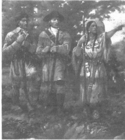
Illustration shows Lewis and Clark getting help from a Native American.

Most of the scientific literature and all of the environmental press dealing with the decline of sage grouse populations assume those declines are primarily the result of negative livestock impacts on grouse habitat. Yet, no creditable research has demonstrated a negative relationship. Depending on the type and degree of livestock grazing, it is possible that the impact to habitat could be either positive or negative to grouse. Studies on the