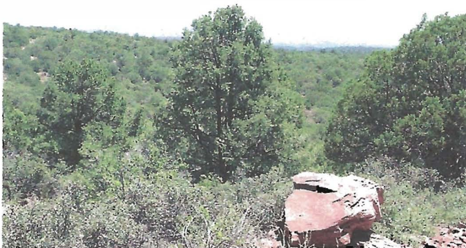
Once grass-rich but now tree-poor, this land is thickly covered with the financial potential for its own rescue and restoration. This Tonto National Forest landscape represents the West’s millions of acres of too-thick, over-competitive piñon/juniper woodland. Horribly denuded and eroding because almost all soil-stabilizing grass and flowers were competed to death by the trees, it could supply many times its present wildlife, watershed and economic value. Diamond Rim is on the far horizon.

Pinchot Institute’s Coordinated Resource Offering Protocol (which studies forest bio-fuels potentials) estimates that seven western states could have important biofueled electric-generation rates in the next few years: Washington, 15 percent; Oregon, 25 percent; California/Nevada, 20 percent; Arizona, 15 percent; New Mexico, 30 percent; and Montana, 25 percent. According to this study, solar-electricity costs average from 40 cents to 90 cents per kilowatt-hour (kWh), and wind costs 16 to 20 cents compared to an average