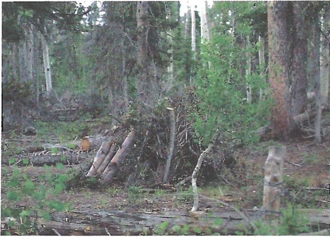
Billions of dollars are lost in dead wood and overstocked trees. Untreated mixed-conifer forests have up to 80 tons per acre of dead, downed logs—added to 50 tons of duff and litter. Wildlife do need some logs for cover, but present levels are a lethal fire threat. Here, the National Park Service piled fuel for winter burning on the Grand Canyon park boundary at public expense.