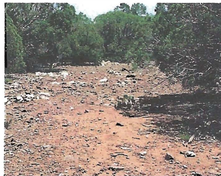
Biological disaster in former grassland. This barren sight is typical of the ground between the aggressive trees. The only worse disaster would be a fire burning the clogged forest—afflicting the soil-poor, degraded, biodiversity-poor land with scouring floods and nonnative weeds.