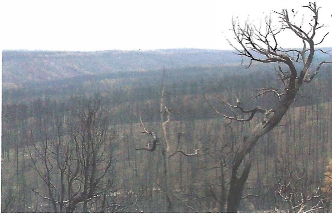
Covering perhaps one-fifth of the area of the Warm Fire (80,000 acres total), this photo gives some concept of its grotesque waste and destruction. There’s no restoration budget. The land will never recover unless it’s allowed to pay for its own healing.