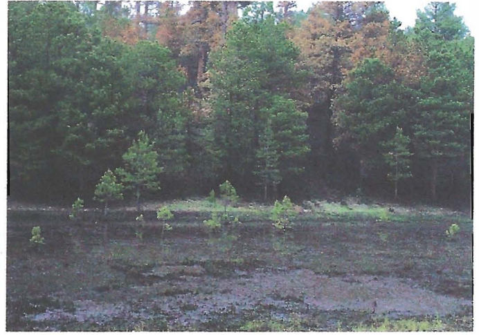
Black runoff from a lightly burned slope shows how badly fire damages water cycles. Prefire—no runoff occurred. Severe fire makes “hydrophobic crusts” on soils, turning them into water-repellent sheets. Millions of forest acres burn up annually. Logging creates vastly less runoff and heals quickly. Small pines encroaching on meadowland are another indication that the water cycle needs help.